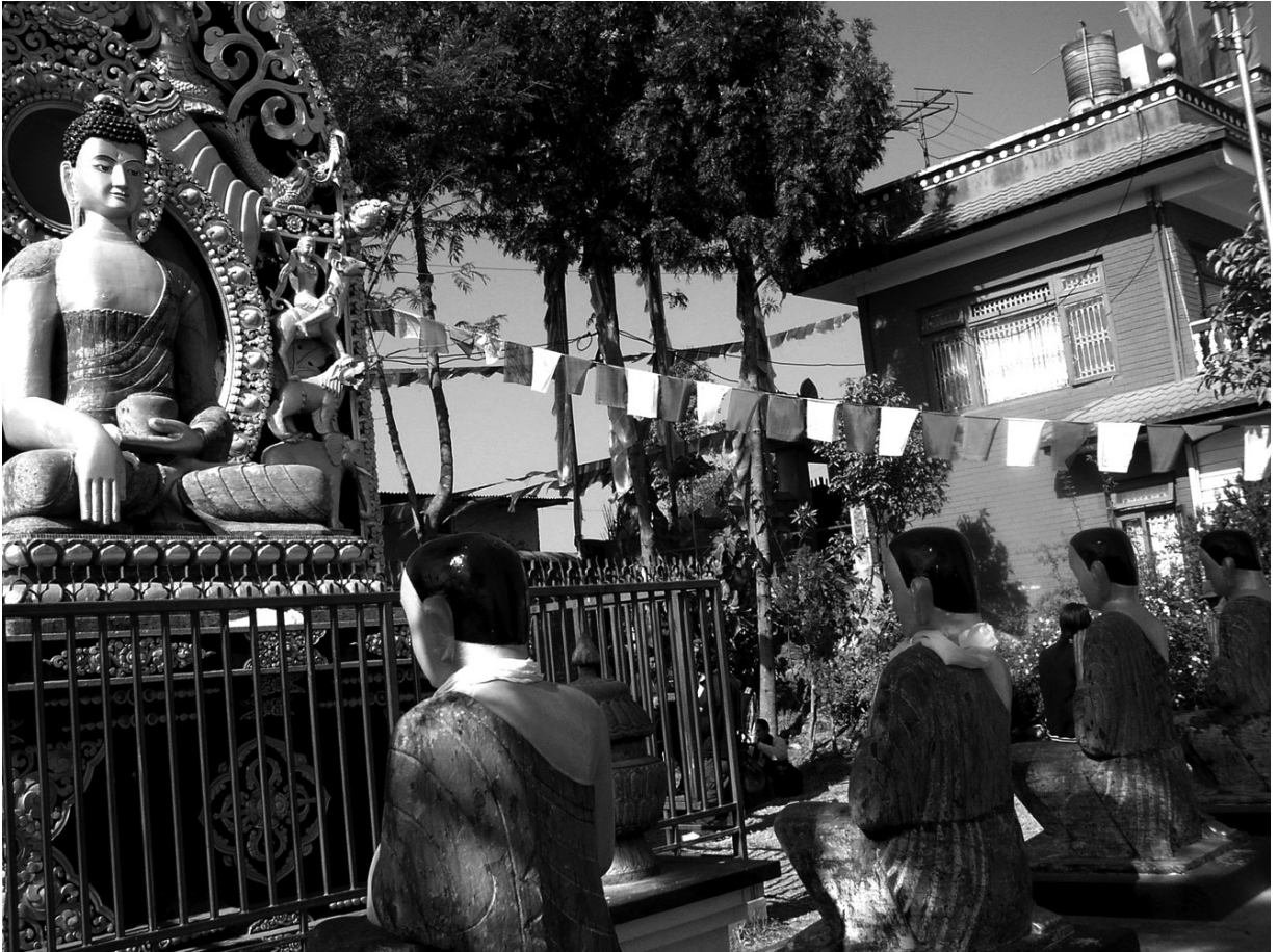
Buddha Śākyamuni delivering his first sermon to his five disciples