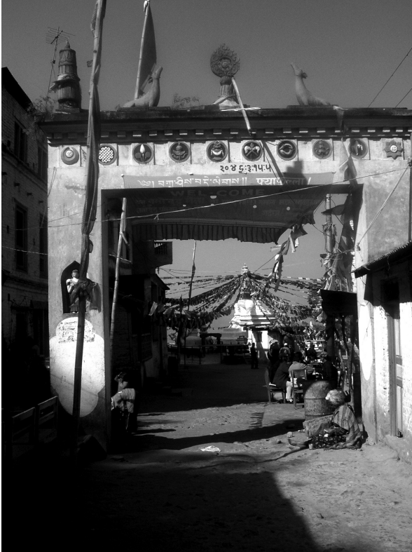
Entrance gate of Namobuddha Stūpa