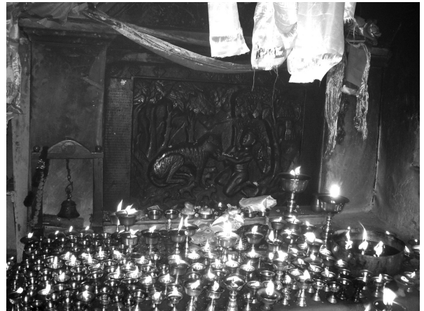
Stone relief depicting Prince Mahāsattva sacrificing his flesh to a hungry tigress and her five cubs