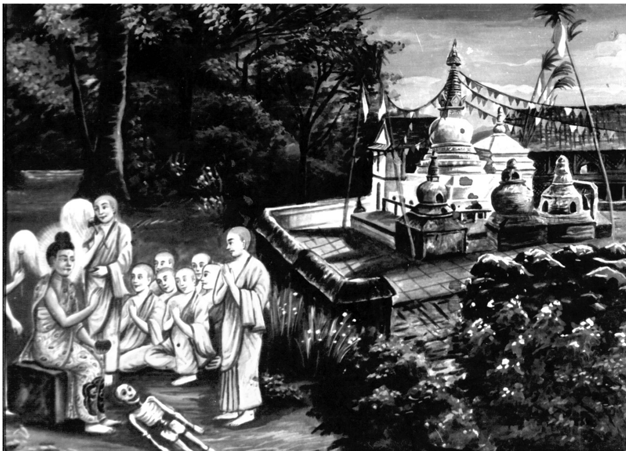
Picture 1 : Lord Buddha narrates the story of his past life as Mahāsattva whose skeleton is seen lying on the ground.