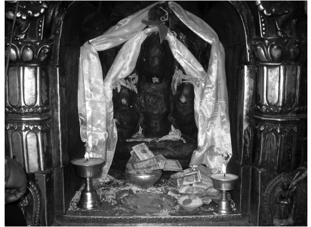
Shrine dedicated to Prince Mahāsattva's mother