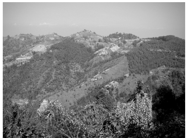
A bird's eye view of the Namobuddha hill ranges