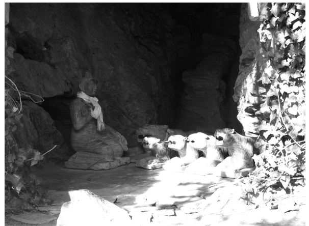
The cave with sculptures of Prince Mahāsattva sacrificing his flesh to hungry tigress and her cubs